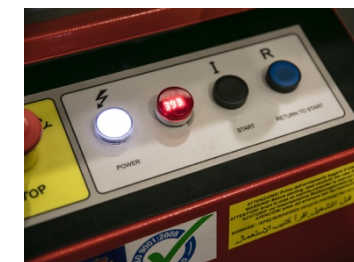
Digital voltage indicator