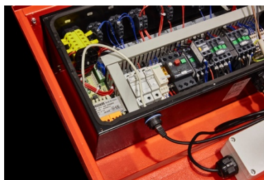
Bluetooth antenna module