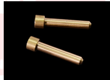
Reversing and grip pins